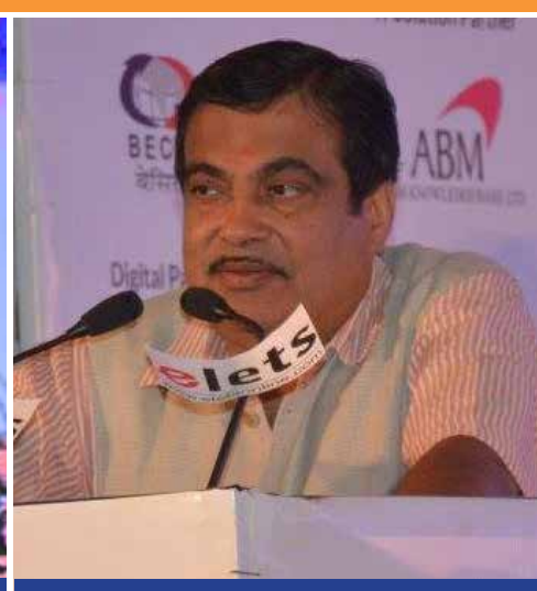
Shri Nitin Gadkari, Union Minister of Road, Transport & Highways & Shipping, Government of India at Smart & Suistainable City Summit 2017, Nagpur