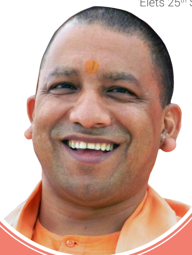
YOGI ADITYANATH Hon'ble Chief Minister of Uttar Pradesh

The 'Aligarh Municipal Corporation' is an esteemed 'Host Partner' of this summit. 'Elets 25 th Smart City Summit-Aligarh 2017' will be unfolded in three parts:- Conference, Awards & Expo