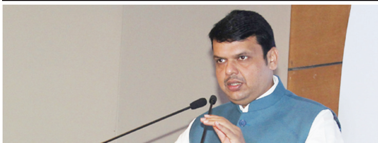
Shri Devendra Fadnavis, Chief Minister of Maharashtra during Smart & Sustainable City Summit 2017, Nagpur