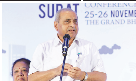
Shri Nitin Patel, Deputy Chief Minister of Gujarat Inaugurates Elets Smart City Summit - Surat 2016