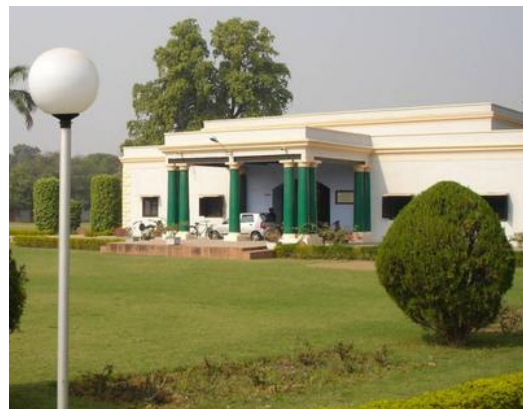
SIR SYED HOUSE