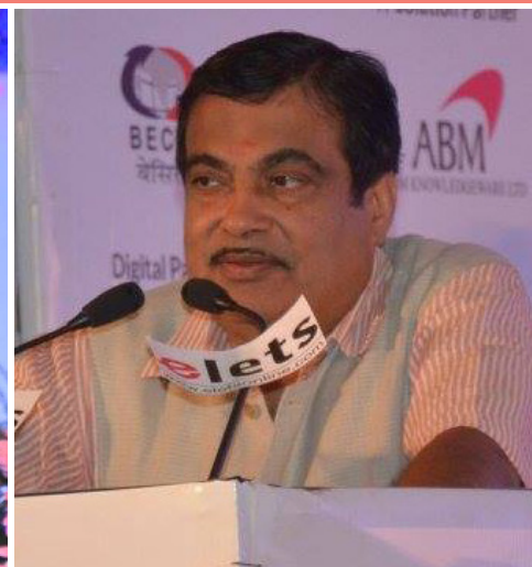
Shri Nitin Gadkari, Union Minister of Road, Transport & Highways & Shipping, Government of India at Smart & Sustainable City Summit 2017, Nagpur