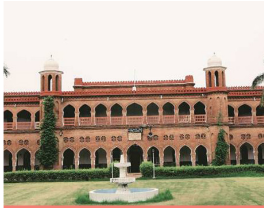
ALIGARH MUSLIM UNIVERSITY