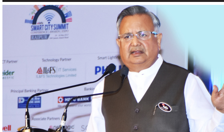
Dr Raman Singh, Chief Minister of Chhattisgarh, speaking during the Smart City Summit, Raipur