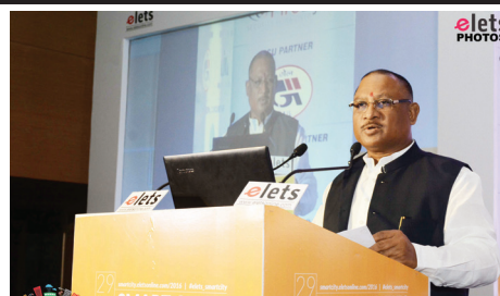
Shri Vishnu Deo Sai, MOS Steel, Government of India at Smart City Summit New Delhi 2016