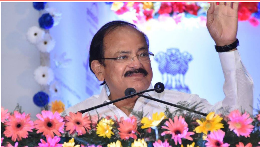
Shri M Venkaiah Naidu, Hon'ble Minister for Urban Development addressing the audience at Smart City Summit Raipur 2017